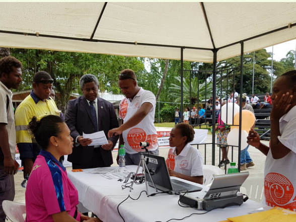
Launching of BVR