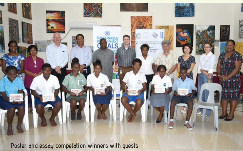
Poster and essay competition winners with quests