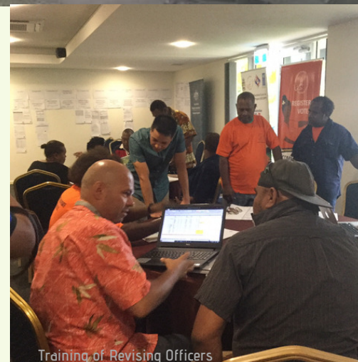
Training of Revising Officers